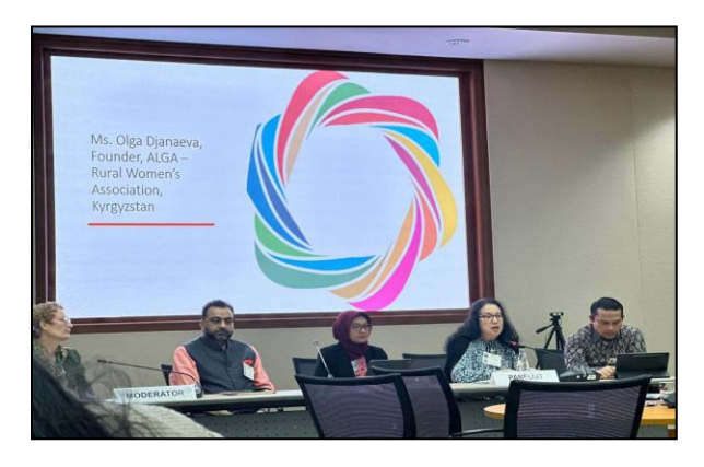
Page 11 of 12