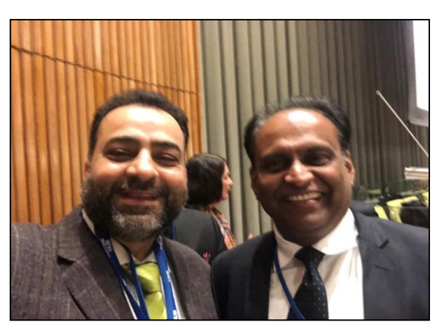
Meeting with DG NMCG