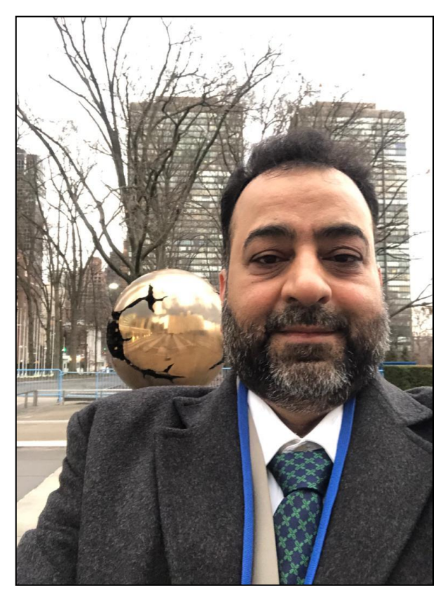
Page 7 of 12