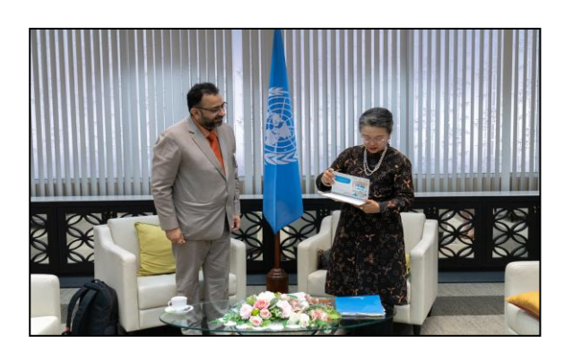
Page 9 of 12